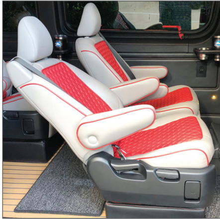
Captain's seats recline and legs lift and extend. Time for a nap or just relax.

The Golf Channel was a must for this package. Land Yacht uses a mobile satellite antenna and the client's choice of satellite receiver.