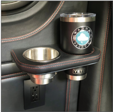
Custom cup holders

Attention to detail is a Land Yacht trademark.