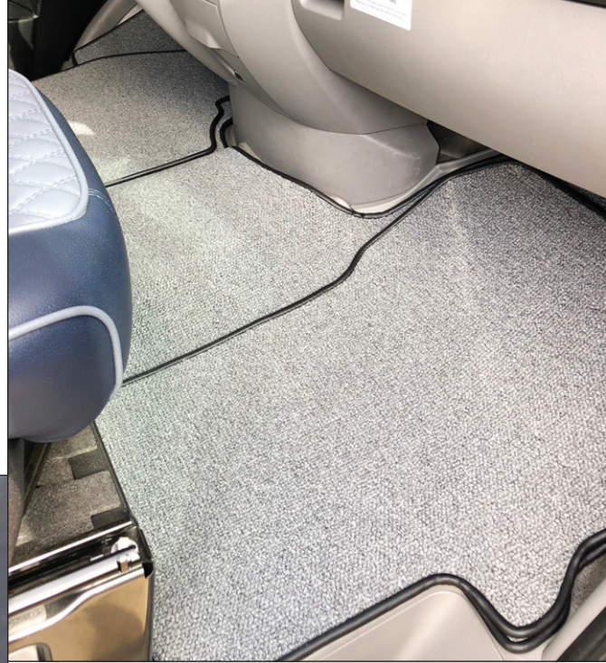
Wool floor mats and carpeting

"Easy to drive. Easy to ride in. Easy to oversleep in the comfortable bed, which we did! All around perfect vehicle."