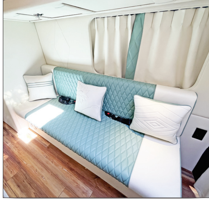
Custom Upholstered Bench to Bed

The spacious personal shower includes a seat, fixed and portable shower heads, privacy curtain, and ample cabinet space to put all of your personals.