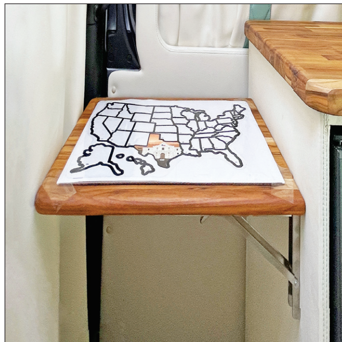
Chop Block Side Table

The spacious personal shower includes a seat, fixed and portable shower heads, privacy curtain, and ample cabinet space to put all of your personals.