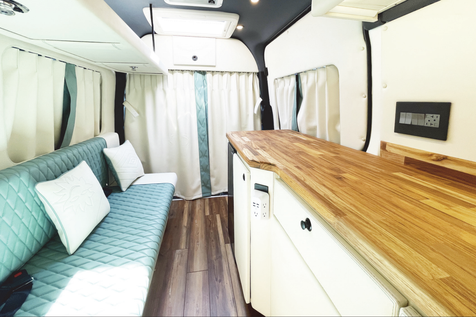
Living Space with Bench to Bed and Mini Kitchen