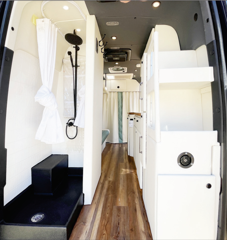
Personal Shower Area