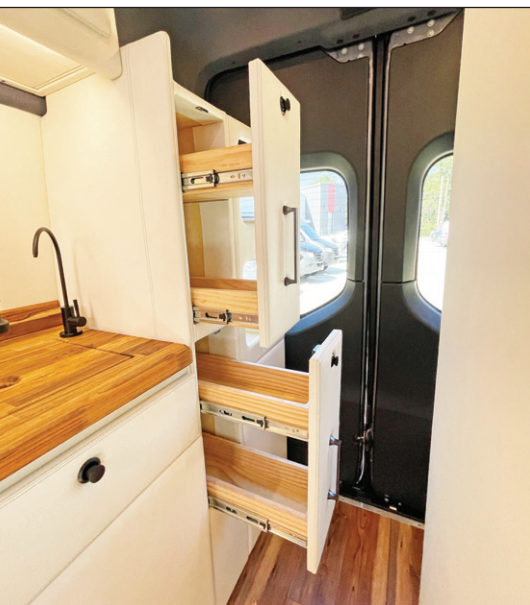
Ample Cabinets & Drawers