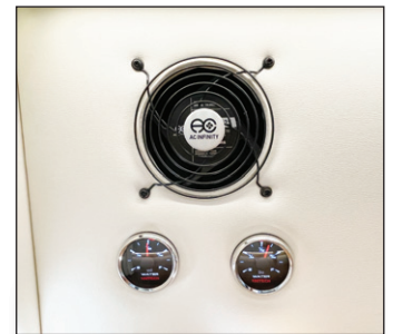
Tank Level Gauges