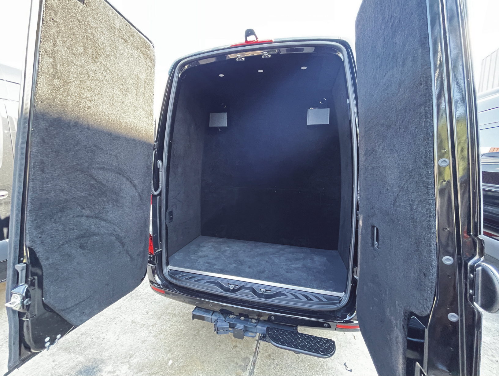
Storage Area with Custom Step for Accessibility