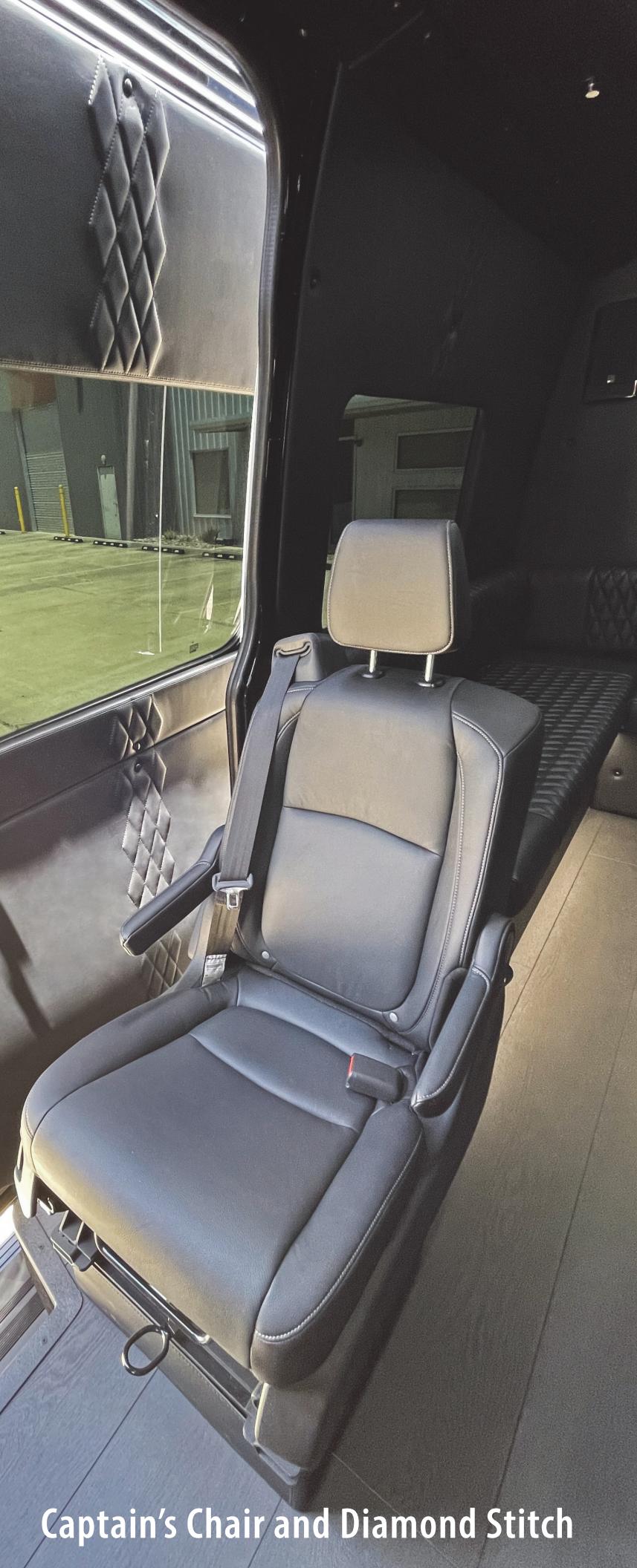
Captain's Chair and Diamond Stitch