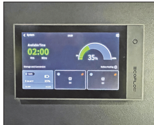
Power System Controller