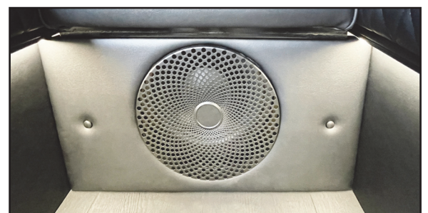
300 Watt Subwoofer