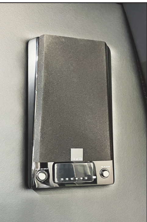
SVS High Fidelity Speakers