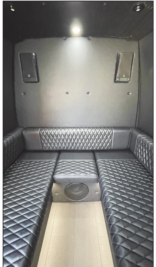
Speakers and 10-Person Couch