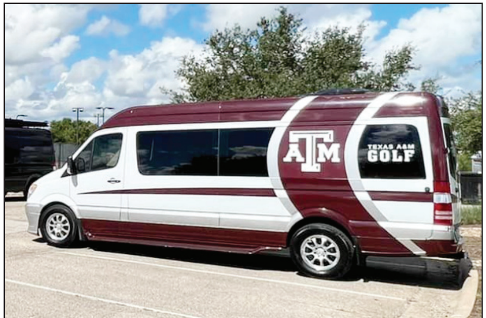
Custom Wrapped Exterior