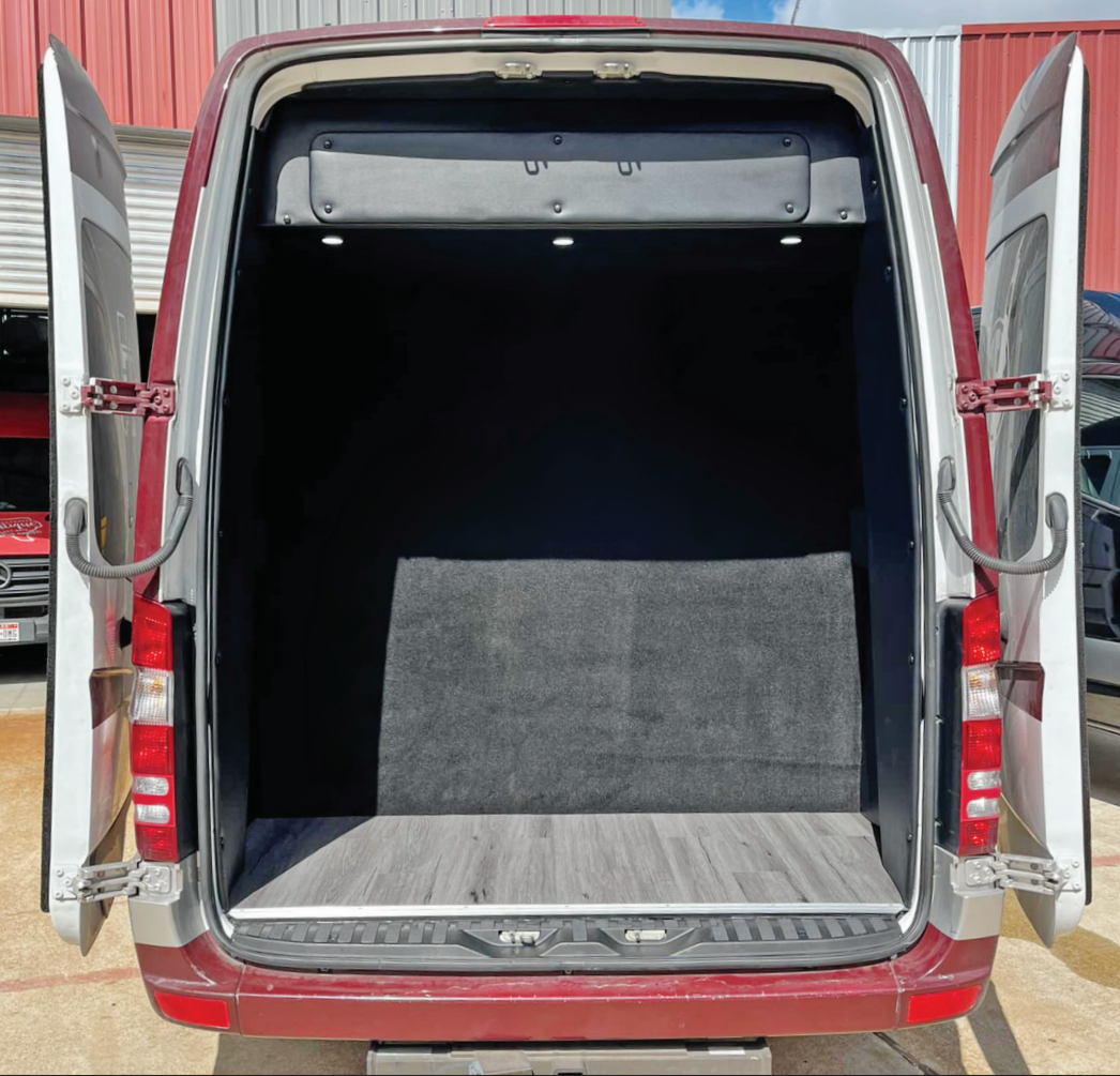
Custom Cargo Area