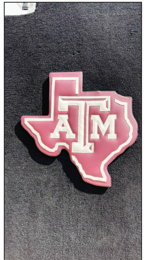
Custom Door Logo