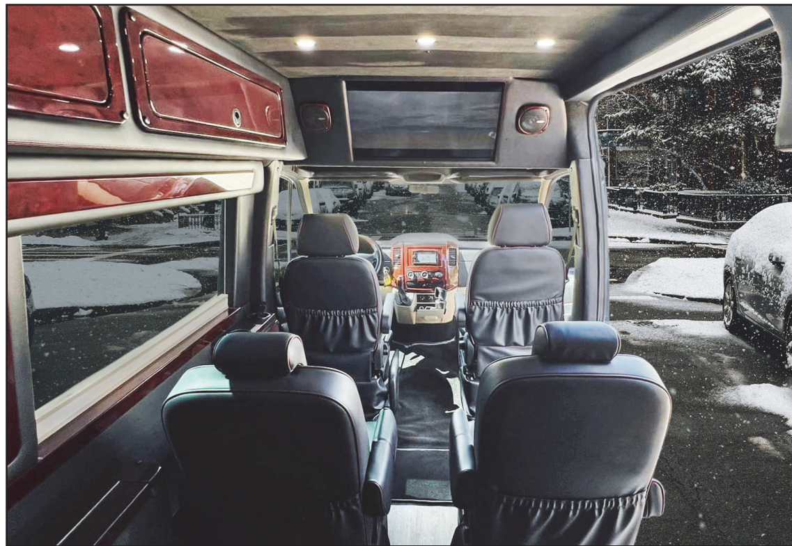
Cabin View with TV and Speakers