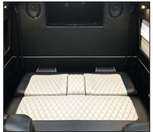
Four Person Bench Converts to Bed