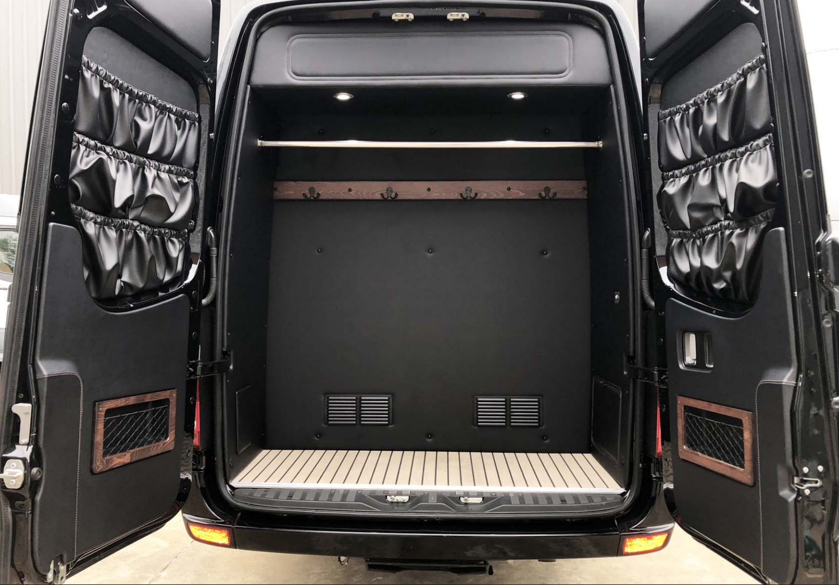
Custom Luggage Area with Upholstered Storage Pouches