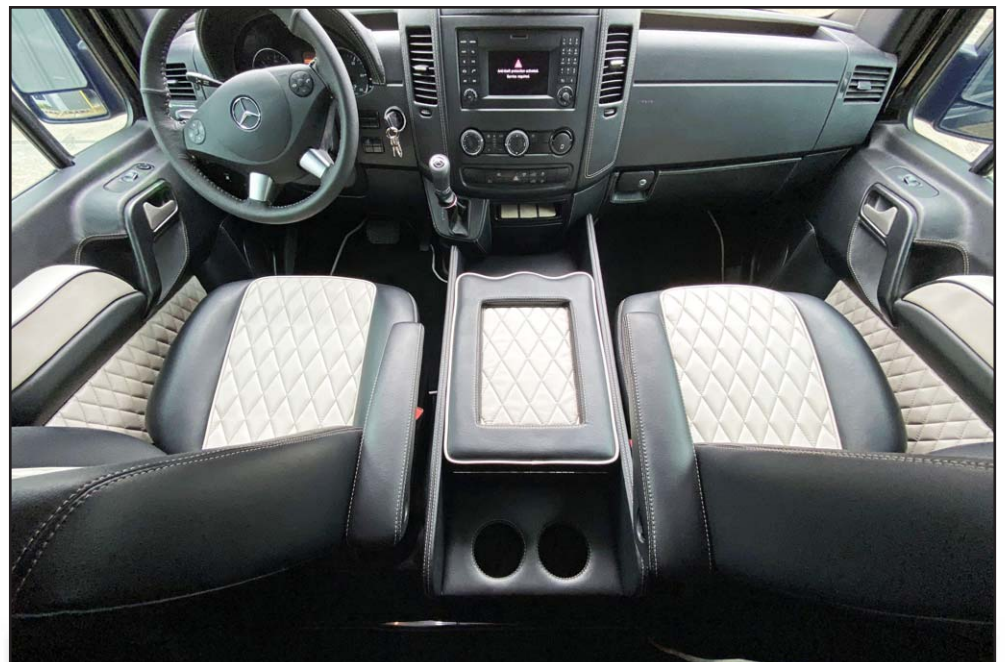
Reupholstered Cockpit with Custom Console