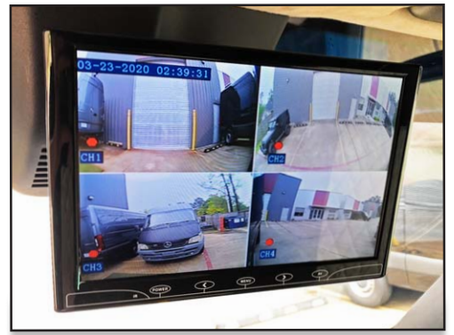
Four Way Camera System