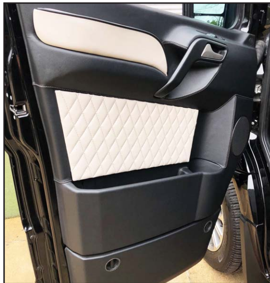
Custom Door Panels