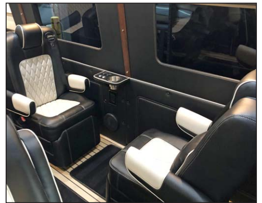
Swivel Captain's Chairs