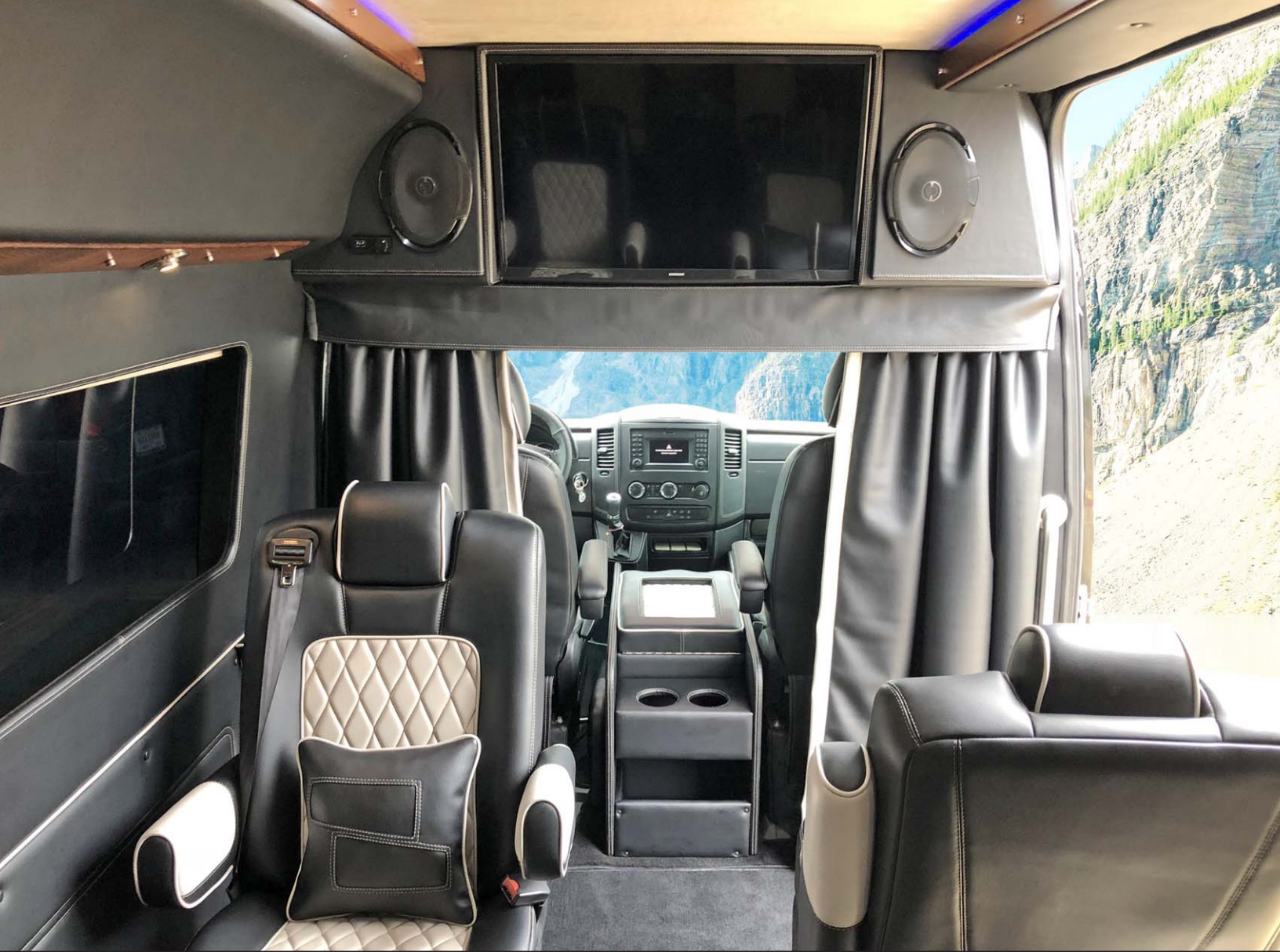
Front Cabin View